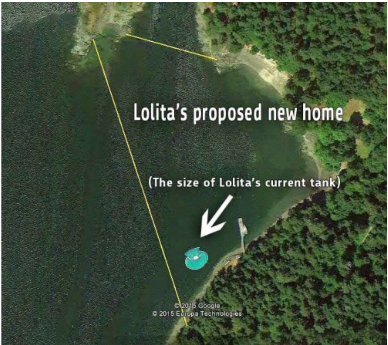
Proposed sanctuary for Lolita. Copyright Free Lolita the Orca.

with extremely high costs. Although the retirement facility would be self-sustaining up to a certain degree by the sale of entrance tickets, food and drinks, large initial investments would be essential.