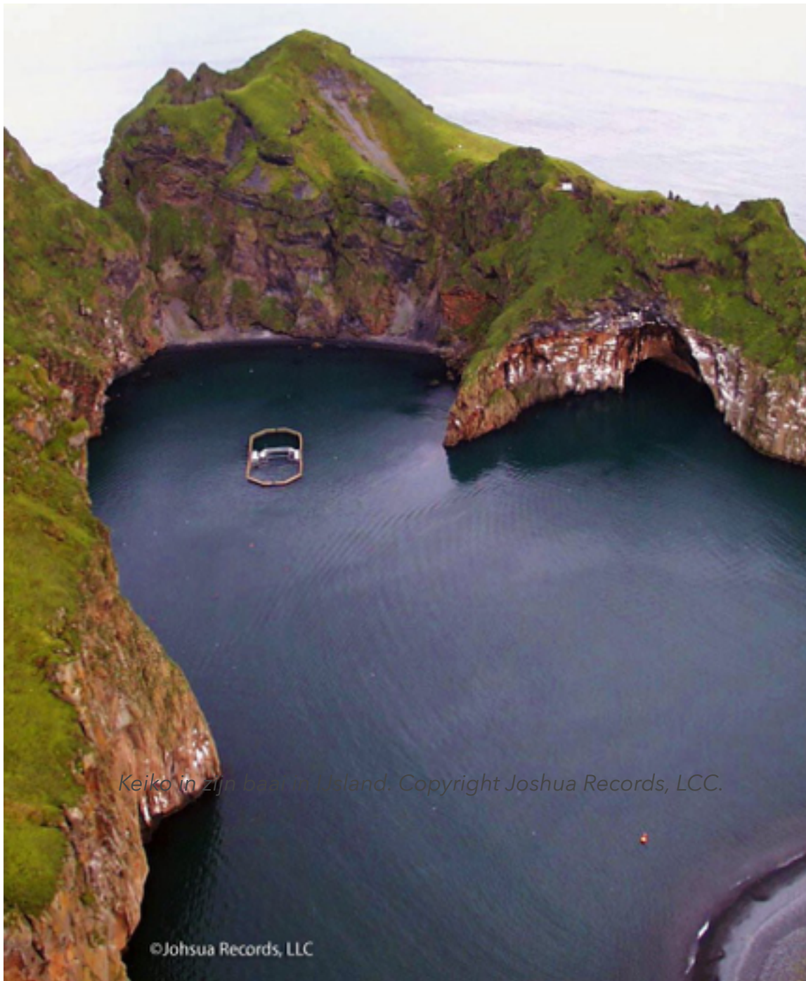
Keiko in zijn baai in Island.