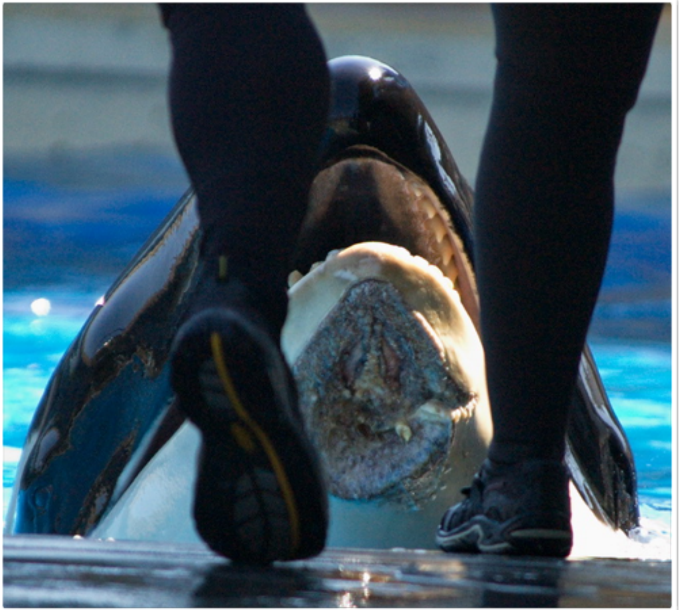
Orcas display aggressive behaviour towards each other triggered by stress.

The SeaWorld amusement parks of California, Texas and Florida combined hold 29 orcas in captivity. The age of these animals ranges from 1 to 51 years. Since the lifespan of these mammals is similar to that of human beings, it is only logical to assume that many of these animals will continue to suffer for decades to come. Therefore, over the last couple of years, an increasing number of NGO's plea to accommodate the animals in delimited fjords or bays instead, in a kind of orca-sanctuary. For killer whales born in the wild, the ultimate goal might even include a full release back into the ocean. SeaWorld's reaction to this suggestion is extremely negative. They claim that relocating the animals out of the SeaWorld parks would be dangerous, even fatal for the orca's as they would fall victim to pollution, diseases and bad weather